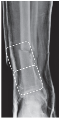
Fig. 1: An AP radiograph taken at the time of injury demonstrating a distal tibia fracture within 2 Müller squares