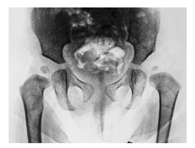
Fig. 3 Inverted contrast anteroposterior pelvis radiograph demonstrating the common proximal femoral physis; O'Brien's Line

related radiographic changes. Tethering of the greater trochanter is convenient to perform at the time of examination under anesthesia, arthrogram, and open adductor and iliopsoas tenotomy. We chose a lateral flexible tether because, when compared to ablative procedures such as a Phemister bone block, drilling or a vertical screw, the femoral neck growth is optimized rather than restricted. This was reflected in the screw divergence noted at follow-up.