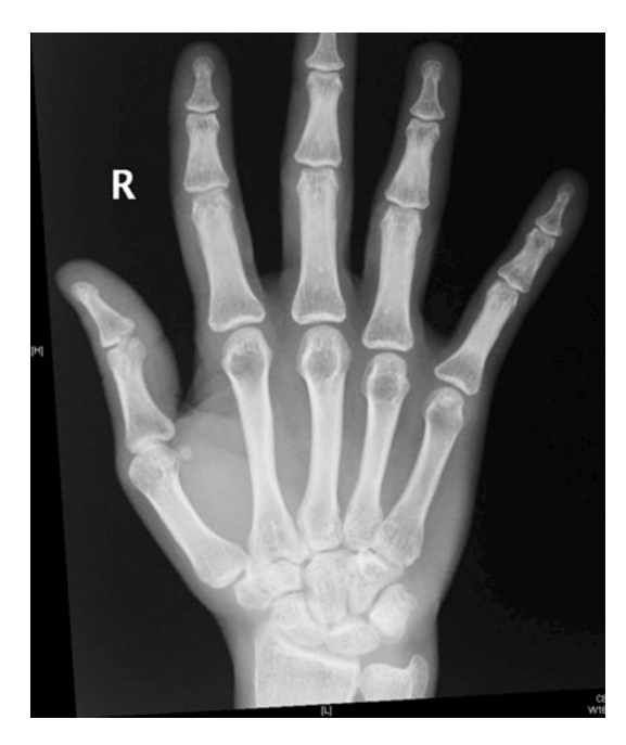
Fig. 5 Postoperative radiograph showing complete reduction in carpometacarpal joint of right thumb

main reason for pursuing exploration was to restore the anatomical alignment of the joint and to repair or reconstruct the APL tendon which was clinically not acting, with the understanding that such intervention is critical to normal thumb biomechanics. Once APL was found disrupted beyond repair, our choice of Palmaris longus tendon for the reconstruction of APL instead of arthrodesis and volar capsulorrhaphy was based on the concept that useful movement is retained and the metacarpophalangeal joint of the thumb is exposed by nature of its function to more extension stress than are the metacarpophalangeal joints of the fingers [8, 9]. Despite developing CMC joint subluxation and SNT deformity, stabilization of CMC joint by APL reconstruction resulted in complete relief of symptoms and the deformity (Fig. 5).