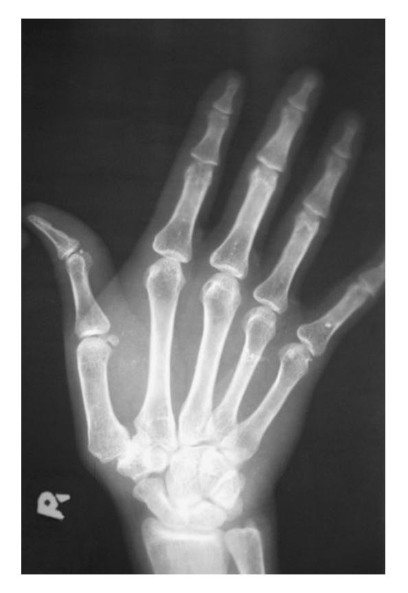
Fig. 2 Preoperative radiograph showing subluxation of carpometacarpal joint of the right thumb

Following the operation, the right hand was immobilized in a short-arm cast for about 4 weeks, with thumb in an abducted and extended position for keeping the first carpometacarpal joint in reduced position. Overall, the postoperative course was uneventful with the exception of mild stiffness of the right hand and fingers that subsided with subsequent mobilization and a short course of physiotherapy. At 107-week follow-up, the patient had long