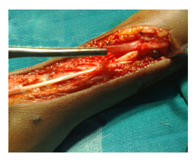
Fig. 3 Operative photograph showing complete isolated division of the right abductor pollicis longus tendon