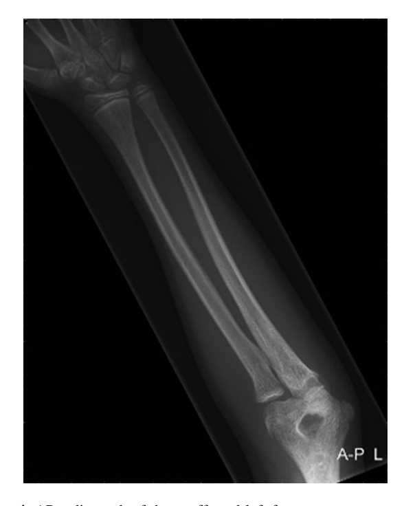
Fig. 4 AP radiograph of the unaffected left forearm