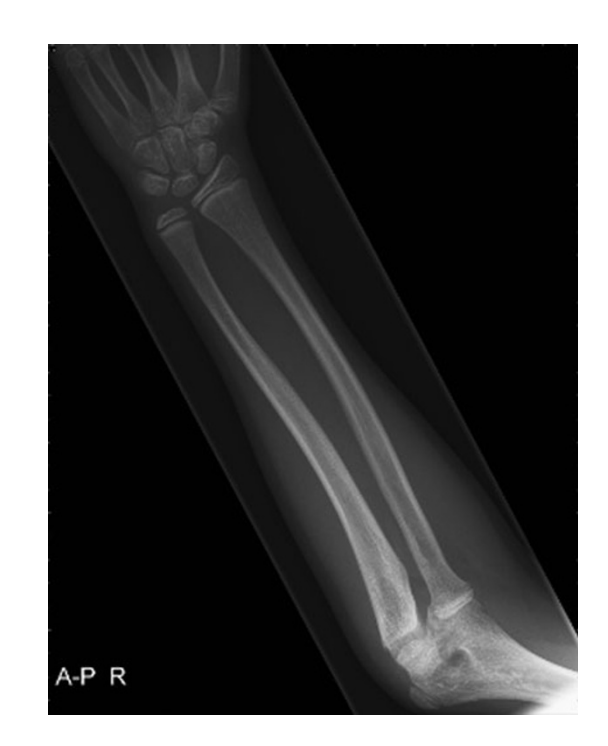
Fig. 3 AP radiograph of the right forearm. A mild bowing of the ulna can be observed