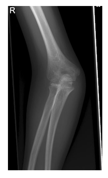
Fig. 2 Anteroposterior (AP) radiograph of the elbow. Note the valgus angle and the dislocation of the radial head

first or second year of life. During maturation, the capitellum fuses with the trochlea and the lateral epicondyle, before it unites with the humeral shaft at a median age of 12–8 years in girls, with a range from 9–6 to 15–0 years