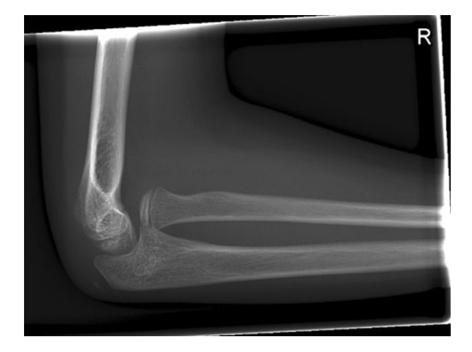
Fig. 1 Lateral radiograph of the patients' right elbow. Note the dislocation of the radial head

To our best knowledge, the combination of congenital radial head dislocation and cubitus valgus has never been described in literature. Premature closure of the physis of the lateral condyle seems the cause on CT imaging. This growth arrest might have several causes, for example, trauma, infection, irradiation or bone tumours [7–9]. An altered physical pressure on the open physis can result in a stimulatory or inhibitory effect on growth and extreme forces can even fully inhibit growth. However, much milder forces can inhibit or modify the epiphyseal growth rate [6]. The capitellum generally becomes visible in the